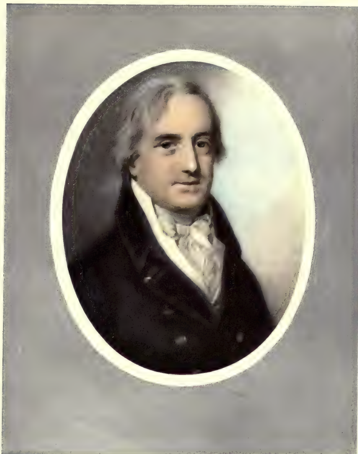
EARL BEAUCHAMP BY GEORGE ENGLEHEART (1805)